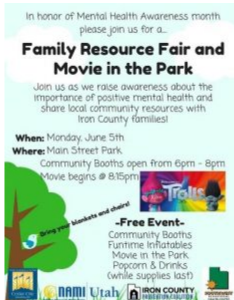
Figure 3 Mental health awareness events flyer.

Project: Decreasing the stigma of mental health issues by hosting a series of films about mental health, and holding an art show featuring community members' creations around the theme "What does it mean to be resilient?"