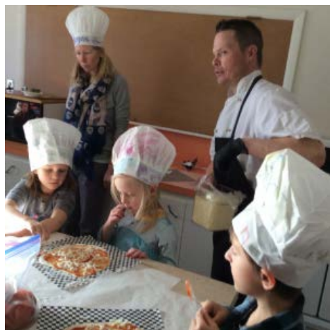
Figure 2 Learning to make pizza.

Project: Cooking and nutritional health classes for economically at-risk community families.